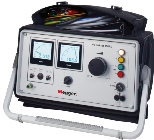
Analog and digital version of control unit HV test set 50/80/110/120 kV