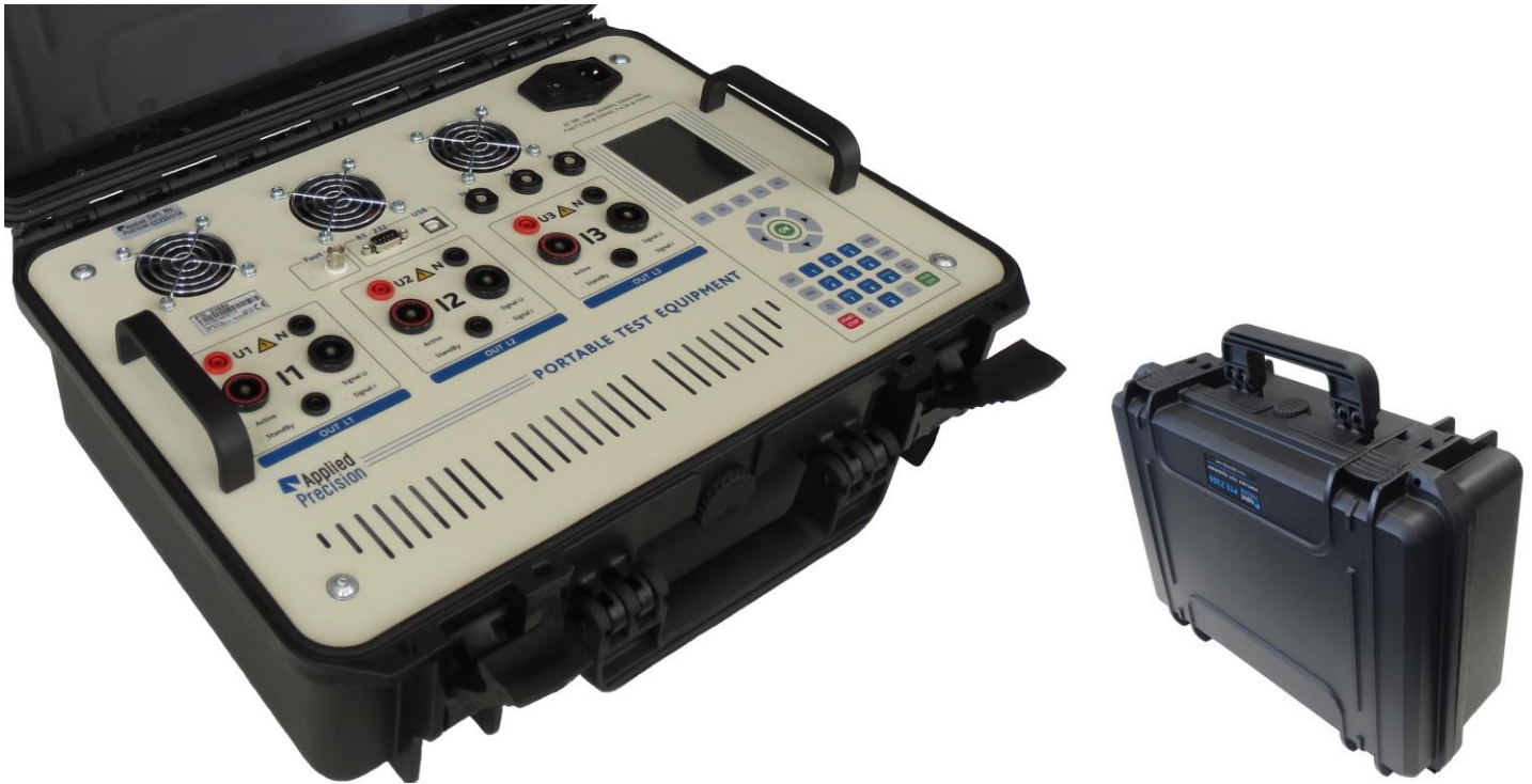
Portable Test Equipment

The Portable Test Equipment consists of an integrated three-phase current and voltage source and a three-phase electronic reference standard of accuracy class 0.05% or 0.02%.