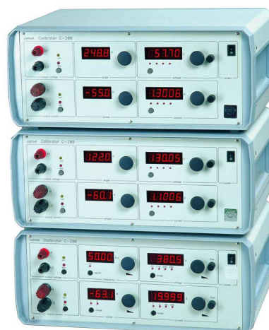
C233C three phase asymmetrical source up to 20A C233BC three phase asymmetrical source up to 100A