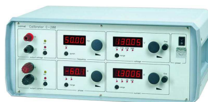
C200 single phase source up to 20A C200B single phase source up to 100A

The C200 Series Power Calibrators are used for adjusting, checking and verification of measuring instruments used in power engineering: active and reactive power meters, phase meters, frequency meters, ammeters, voltmeters, transducers of these quantities, monitoring systems and frequency, voltage and current relays in single and three phase symmetrical and asymmetrical configurations for symmetrical and asymmetrical loads.