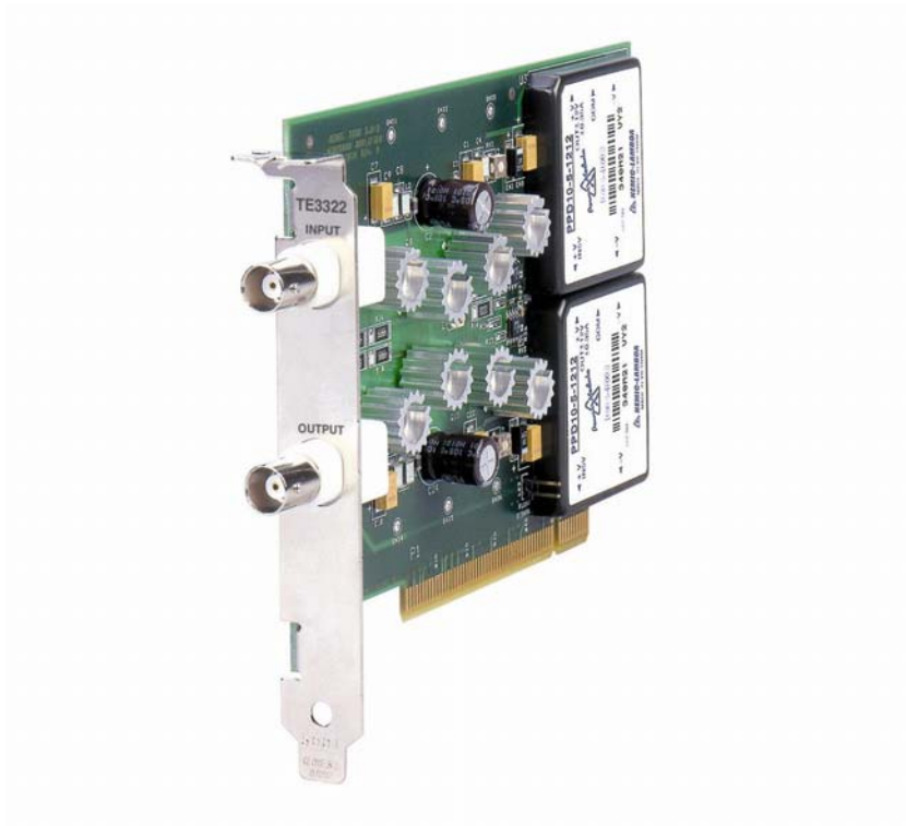
Figure 1-1, TE3322