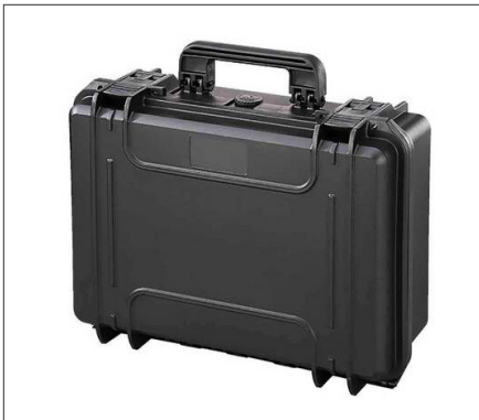
Carrying case - P/N: 978852000