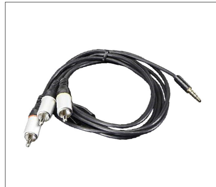
A/V external video cable P/N: 978853000