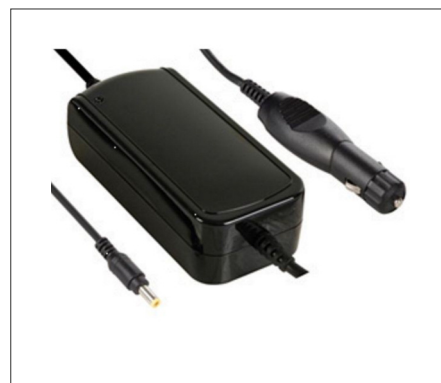
Car cigar lighter adapter P/N: 978361000