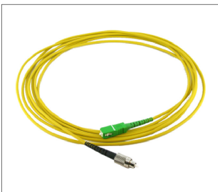
Optical fiber patchcord FC-APC / SC-APC - P/N: 978754710