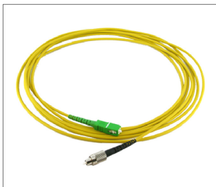
Optical fiber patchcord FC-PC / PC-APC - P/N: 978754700