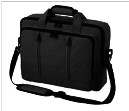
Carrying bag (provided in standard) P/N: 978851000