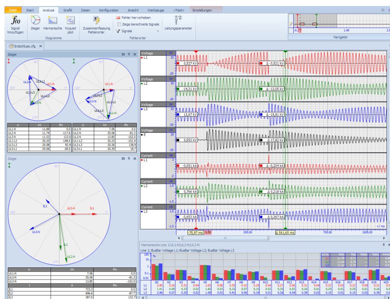
Fig 4: Vector analysis and harmonic analysis