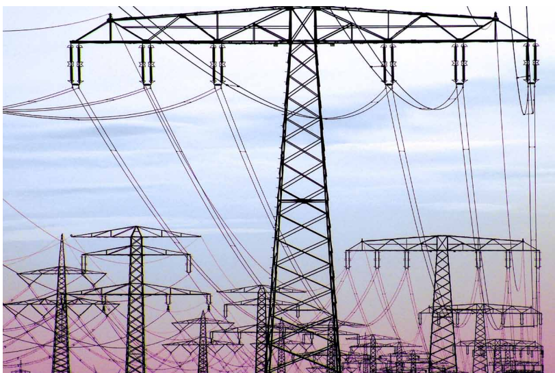
Fig. 3: Pylons

For integration in substation control and protection or for the exchange of data with systems from other manufacturers, SHERLOG CRX can use a range of data protocols, including IEC 61850 and Modbus. Access to the measurement data can be afforded to a number of different users or systems simultaneously. This means that SHERLOG can be integrated within an IEC 61850 host system, for example,