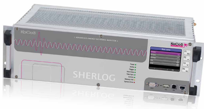
Fig. 1: SHERLOG CRX front view