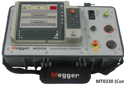
MTO330 (Computer touchscreen)