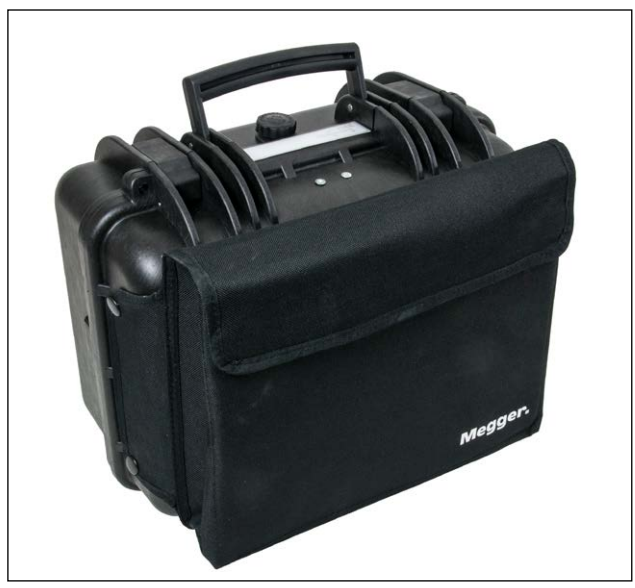
The rugged enclosure for PCA2 has a detachable pocket for cables and accessories.