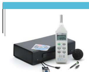
The C.A 834 and its accessories