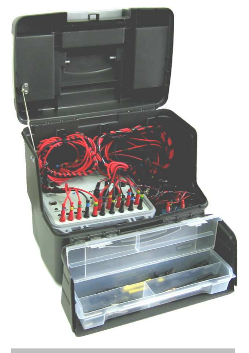
View of NSQ400 set