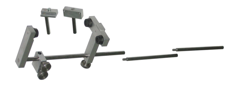
Photo head's holder UCF100 is designed for alternative mechanical mount of CF100 and CF101 photo heads, which with Calport100, Caltest10 and Caltest300 testers or C300 power calibrator are used for testing electronic and inductive energy meters. The UCF100 holder allows to mount a photo head to energy meters when it is difficult to mount heads to the meter by the head's sucker, e.g. minus temperature or when there is no place near meter.