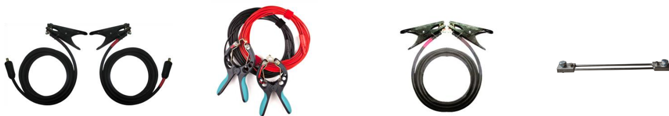
Current cables with battery clamps Voltage Sense cables with TTA clamps Current connection cable with battery clamps Test shunt