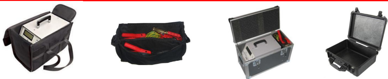
Device bag Cable bag Transport case Cable plastic case