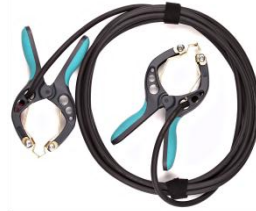
Current connection cable with TTA clamps