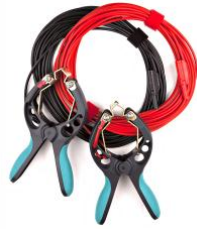
Voltage Sense cables with TTA clamps