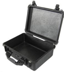
Cable plastic case