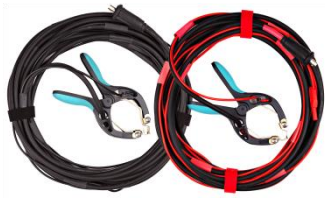
Current and Sense cables with TTA clamps