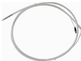
Voltage sense cables