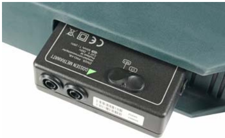
Figure 1: Leakage Current Measuring Adapter at the PROFITEST MXTRA

Before performing measurements, the adapter’s measurement outputs must be plugged into the measurement inputs at the left-hand side of the PROFITEST MXTRA or SECULIFE IP (2-pole current clamp input and probe input).