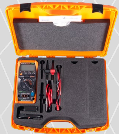
METRAHIT H+E CAR-Set