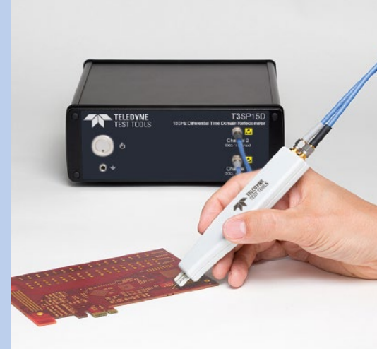
Based on the true differential design, there is no need for a physical ground connection if differential lanes are measured