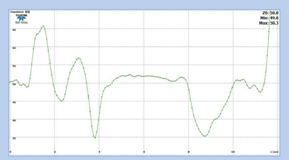
OSL calibration in time domain avoid aberrations effects in impedance plots and let the user identify impedance anomalies with less than 3 mm resolution