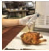
Probe meat and poultry