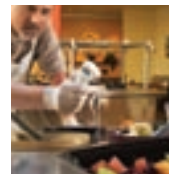
Steam tables and salad bars