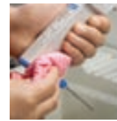
IP54 sealed for easy cleanup