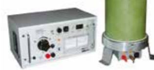
T22/1 AC HV test system