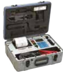
BITE2P Battery impedance tester < 7000 ah