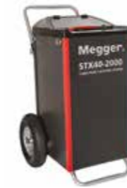
STX40 Portable fault location system