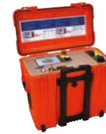
HVB10 High voltage bridge for fault location in long cables