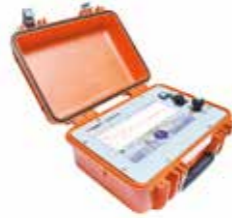
Teleflex® SX-1 Portable radar/time domain reflectometer