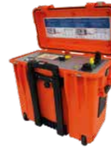
MFM10 Sheath fault location system