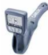
CARLOC Utility locating system