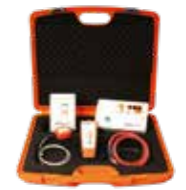
CI/LCI Cable identifier