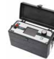
Ferrolux® FLG12 Audio frequency generator