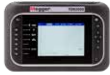
TDR 2000 series Advanced dual-channel TDR