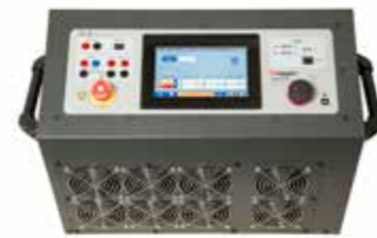
TORHEL900 Battery discharge test system