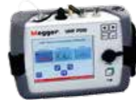
UHF PD Detector Online PD substation surveying system