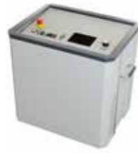
VLF Sine 45 kV Test system for medium voltage cables