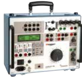
SMRT1D Single-phase relay tester