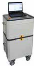
MV DAC-30 Damped AC voltage test set with a peak voltage of 30 kV