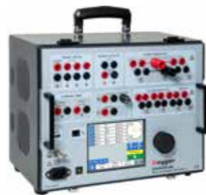
SMRT46D Multi-phase relay tester