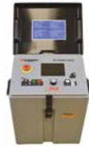
EZ-THUMP 3 kV and EZ-THUMP 4 kV, model V2 Highly portable fault location systems for LV networks