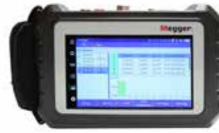
BITE5 Battery tester