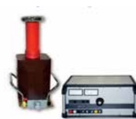
High-voltage test system HPG 50 ... 110-H Compact and powerful AC test systems