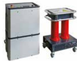
TDM 45 High power test and diagnosis combination for MV cables