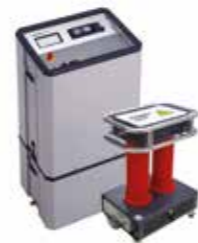
TDS NT series Portable high power test system for testing and diagnostics of MV cables up to 40 kV and 60 kV