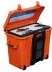
VLF Sine 34 kV Test system for medium voltage cables