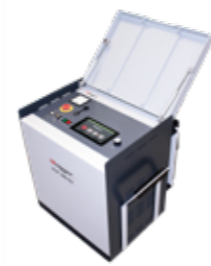
VLF Sine 62 kV Test and diagnostic system for medium voltage cables