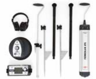
digiPHONE+2 NTRX Set digiPHONE+2, plus ESG earth rods and Ferrolux receiver