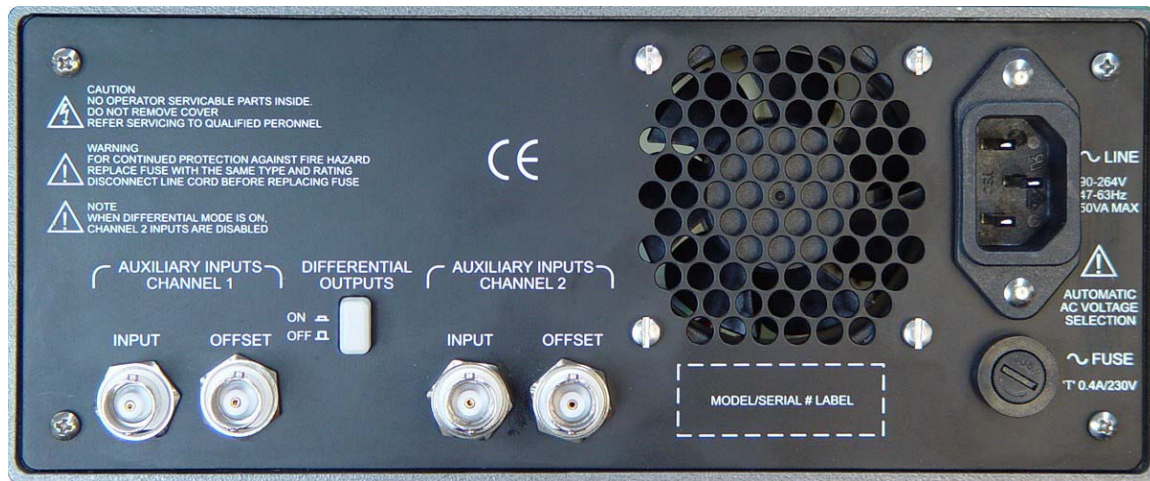
Figure 1-2, The 9250 Rear Panel