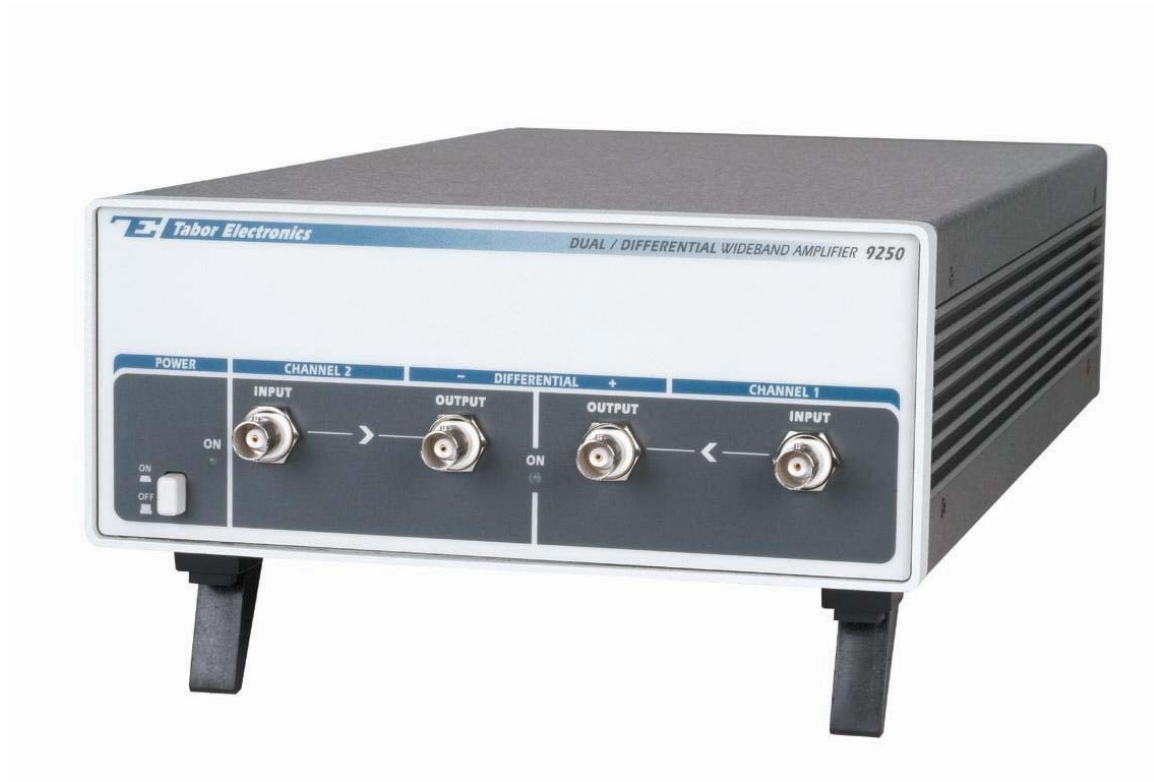
Figure 1-1, The Model 9250