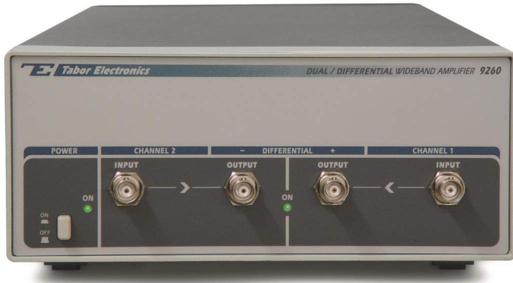
Figure 1-1, The Model 9260