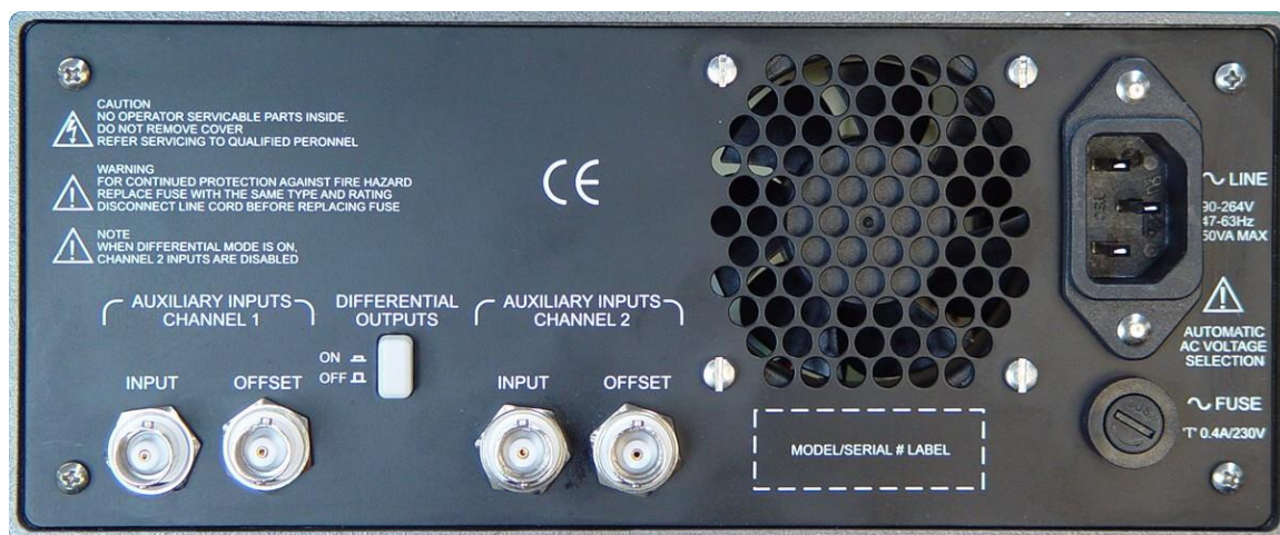
Figure 1-2, The 9260 Rear Panel

The rear panel is rarely used for normal operation however, there are some connections you must do before you can operate the amplifier for example, connecting the mains power to the instrument. There are other connectors and parts on the rear panel; These are discussed in the following paragraphs. Refer to Figure 1-2 throughout the following description.