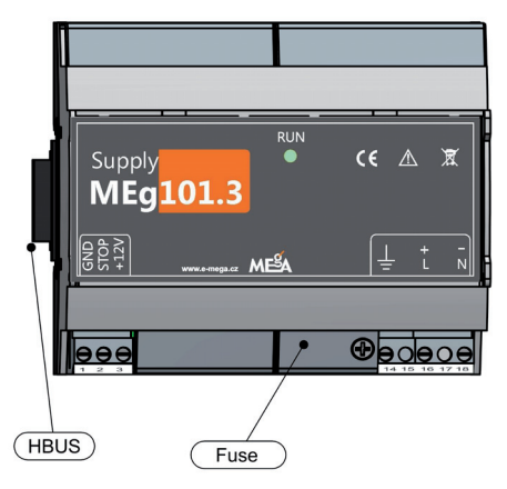
Fig. 1: Supply MEg101.3a unit