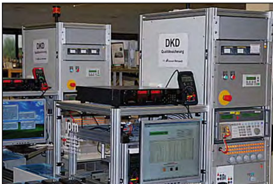
The calibration center of GMC-I is specialized in ensuring the highest possible measure of precision.

If the battery is switched off or disconnected while the alternator is still generating energy, pulse E5 occurs. Due to the fact that the low impedance of the battery is no longer available, overvoltages occur which are applied directly to the electronics. This type of disconnection may result from battery cable failure due to corrosion, or when the vehicle is jump started. This is a high energy pulse with a duration in the millisecond range.