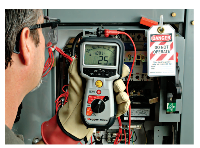
Panelboard testing is faster, easier and safer with the new MIT400 Series.