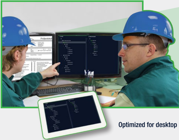
Optimized for desktop PCs and Windows tablets