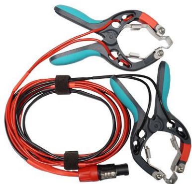
H winding current and sense cables with TTA clamps