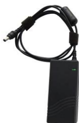
Power supply adapter