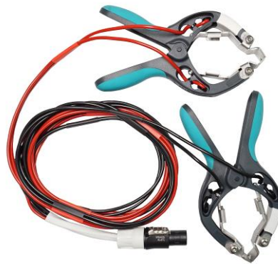
X winding current and sense cables with TTA clamps