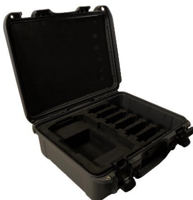
Plastic transport case for TWR-H, TRT-H & RMO-TH