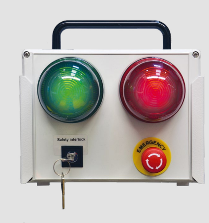
Safety equipment in accordance with BGI 891 and VDE 0104