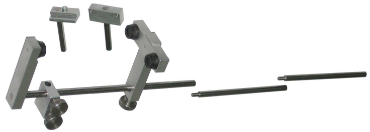
Photo head's holder UCF100 is designed for alternative mechanical mount of CF100 and CF101 photo heads, which with Calport100, Caltest10 and Caltest300 testers or C300 power calibrator are used for testing electronic and inductive energy meters. The UCF100 holder allows to mount a photo head to energy meters when it is difficult to mount heads to the meter by the head's sucker, e.g. minus temperature or when there is no place near meter.