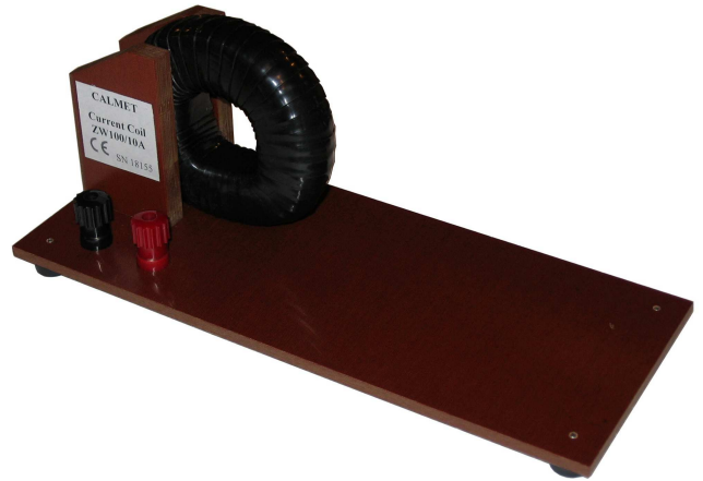
ZW100/10A i ZW10/20A

In the presented circuit, it is also possible to test current clamps CT. In the case of current clamps with current output, the output clamp's current I_{CT} should be measured by means of reference ammeter M, in case of clamps with voltage output, the voltage U_{CT} should be measured by means of reference voltmeter M.