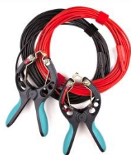
Voltage Sense cables with TTA clamps