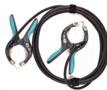
Current connection cable with TTA clamps