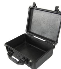
Cable plastic case