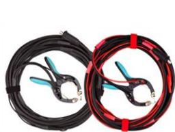
Current cables with TTA clamps