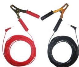
Voltage sense cables