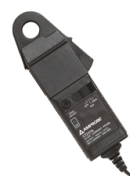
Current clamp 30/300A + cable set 5 m