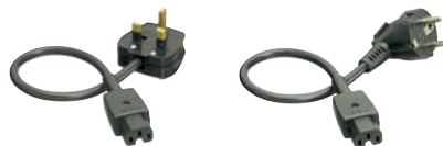
EXTL100-02 (UK plug)