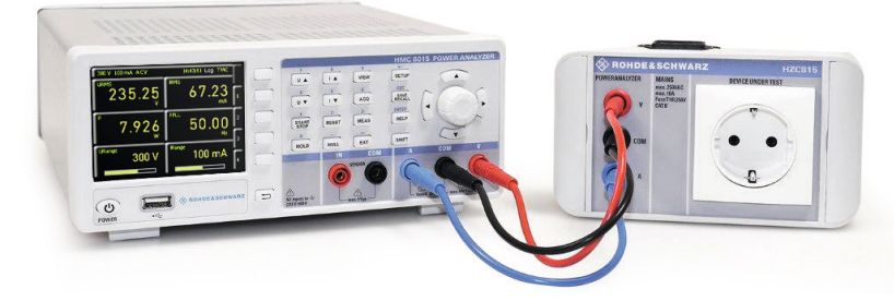
R&S®HMC8015 power analyzer with the HZC815 adapter.